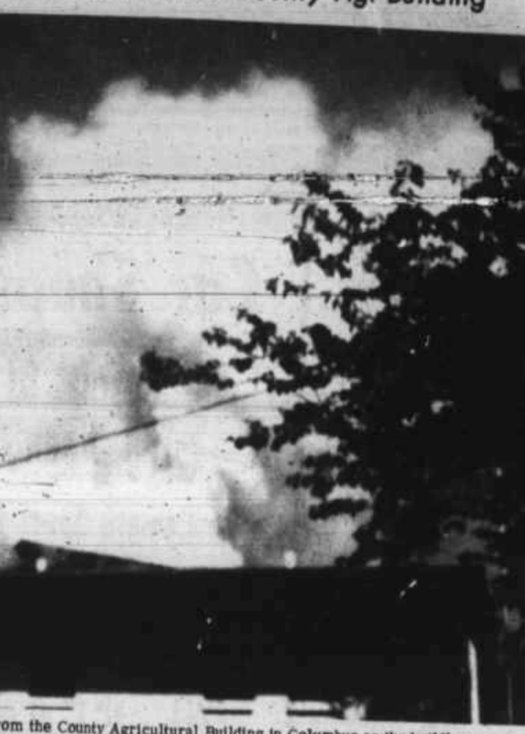
Smoke billows from the County Agricultural Building in Columbus as the building was completely gutted by fire last Wednesday afternoon. Columbus firemen fought the blaze for nearly four hours but still damage to the building and equipment was reported to be heavy.